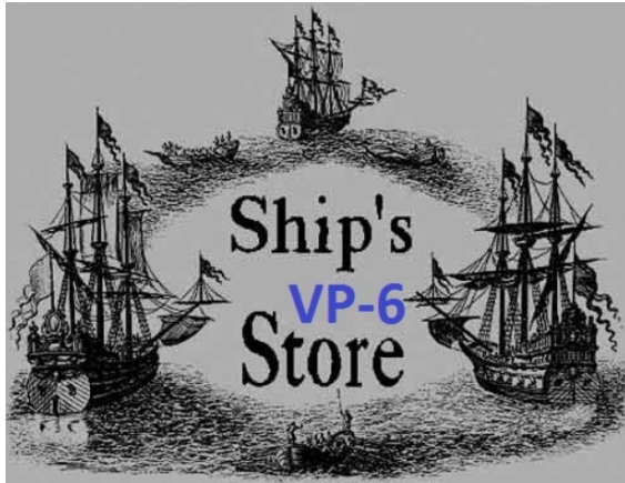
Sample Item in the Ship's Store: